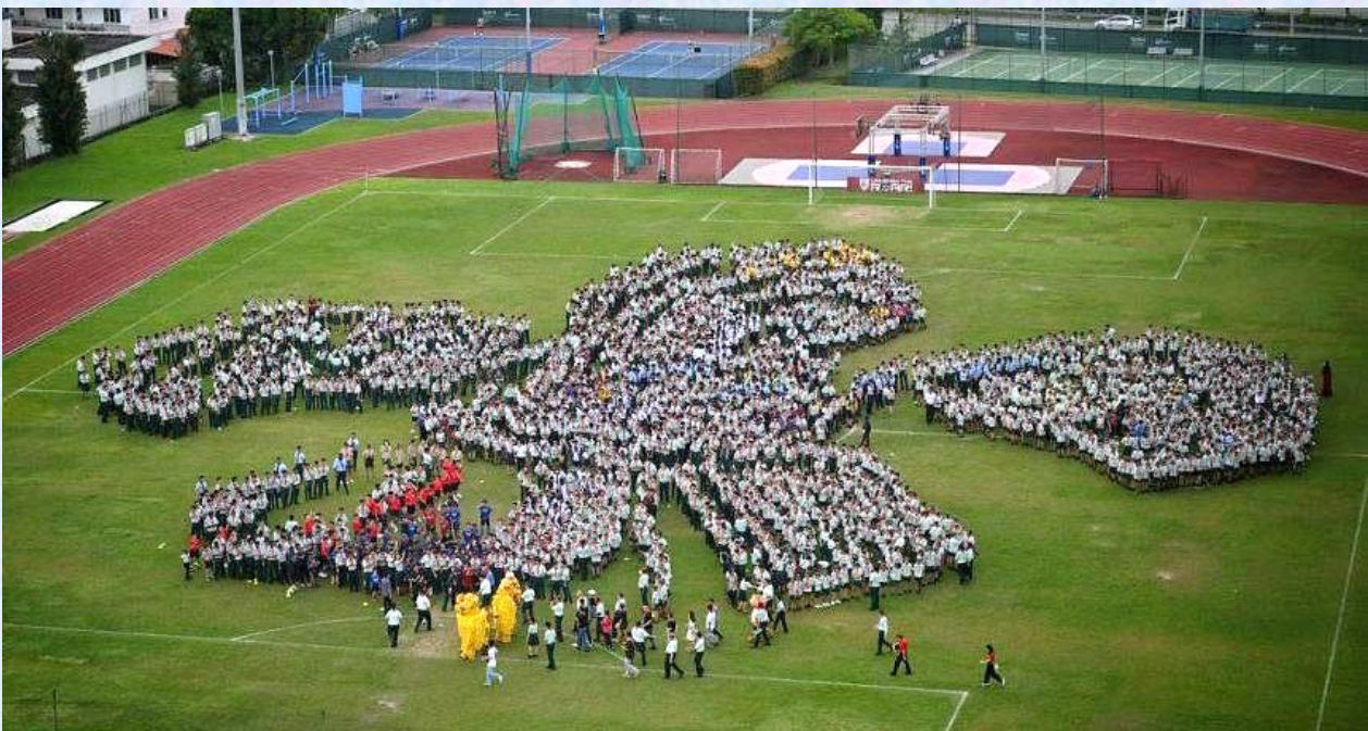
The fleur-de-lis (an important symbol for scouting around the world) formed at the event.